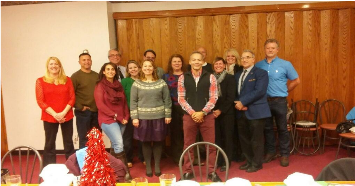
d359-DOL Meeting 12-14-16