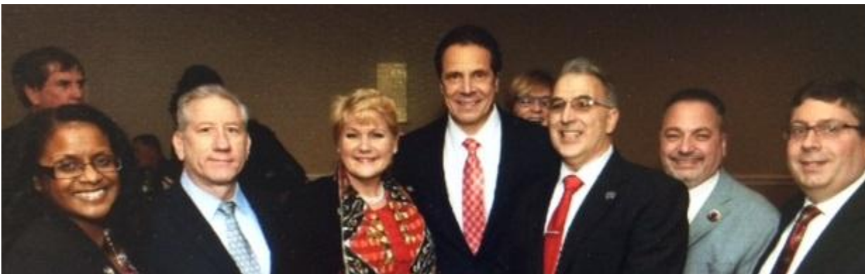
AFL-CIO Holiday Celebration 12-15-16