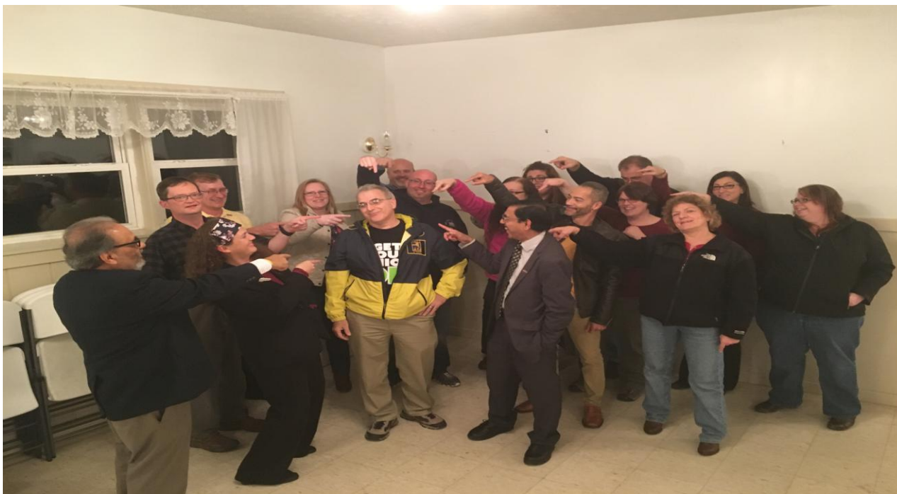
d222 Contract Meeting 11-30-16

Dec. 7 – Attended d175 DOT Local L/M meeting. Minutes are being transcribed in real time on large screen for all to review and approve at end of meeting. Topics included the 3-15-16 Open L/M Meeting, new FE Test Prep Program, and 47 waivers have been approved recently. Minutes can be found here: http://www.pef175.org/